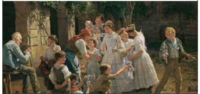
On Corpus Christi Morning by Ferdinand Georg Waldmüller

For more information, email desaleskofc@gmail.com